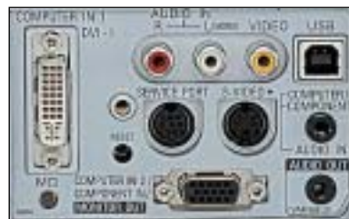
PLC-XU56/XU51 Terminal Input Panel

Because its products are subject to continuous improvement, SANYO reserves the right to modify product design and specifications without notice and without incurring any obligations.